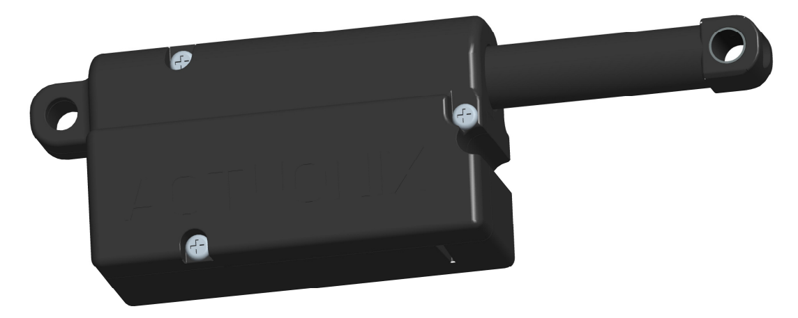
Figure 1: PQ12 Actuator with new clevis on shaft

No change has been made to the supplied mounting hardware as all pieces remain compatible with the updated shaft tip.