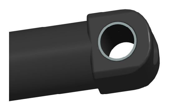
Figure 2: Close-up of new clevis