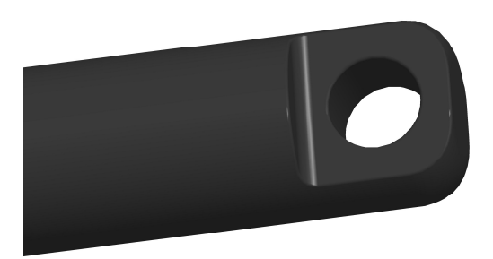
Figure 3: Close-up of old clevis

Affected Parts: PQ12 Shaft Part #: 10324